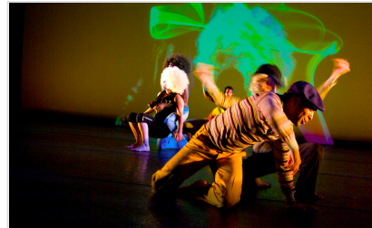
"Prophets of Funk" goes the entertainment route to creating community.

At: Institute of Contemporary Art, through tomorrow. Tickets $40. 617-876-4275, www.worldmusic.org.